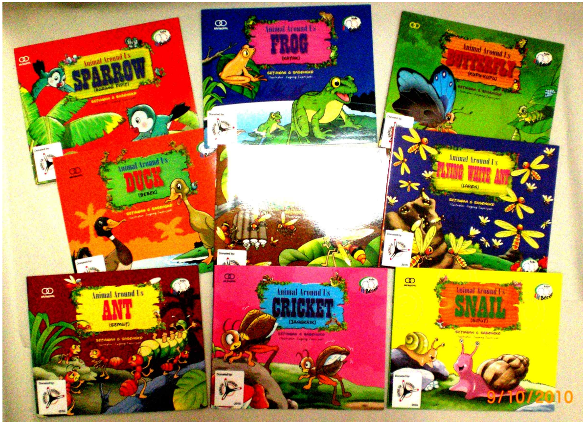
Series of 'Animal Around Us' - Target Group : Elementary School Students.