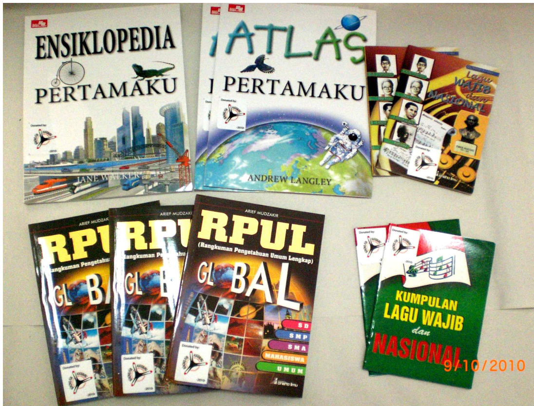
Encyclopedia, Atlas, National Songs Collection Book