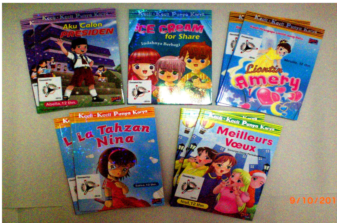
Series of 'Readings written by Children' - Target Group : Elementary School Students.