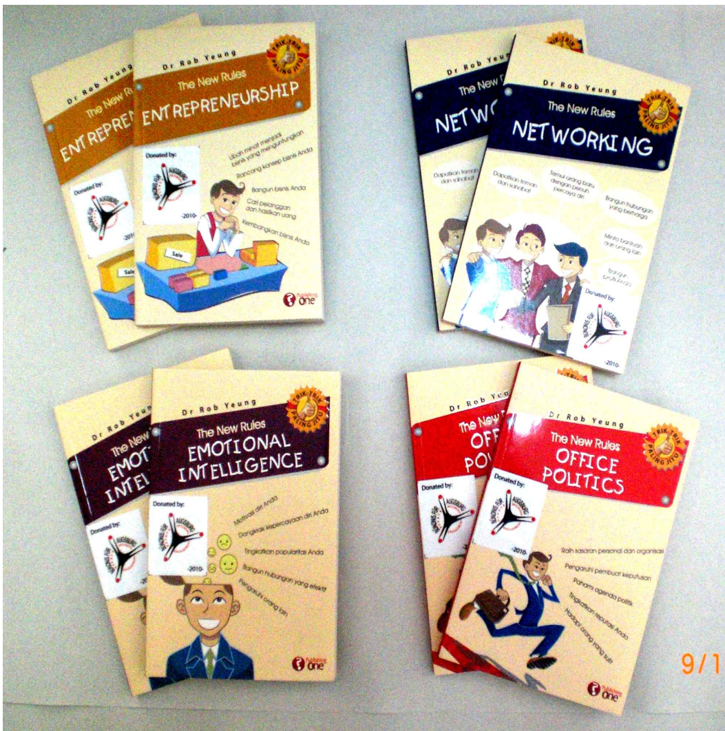
Self-Help / Self-Improvement Books for Teenagers & Adults (Entrepreneurship, Networking, Emotional Intelligence, Office Politics)