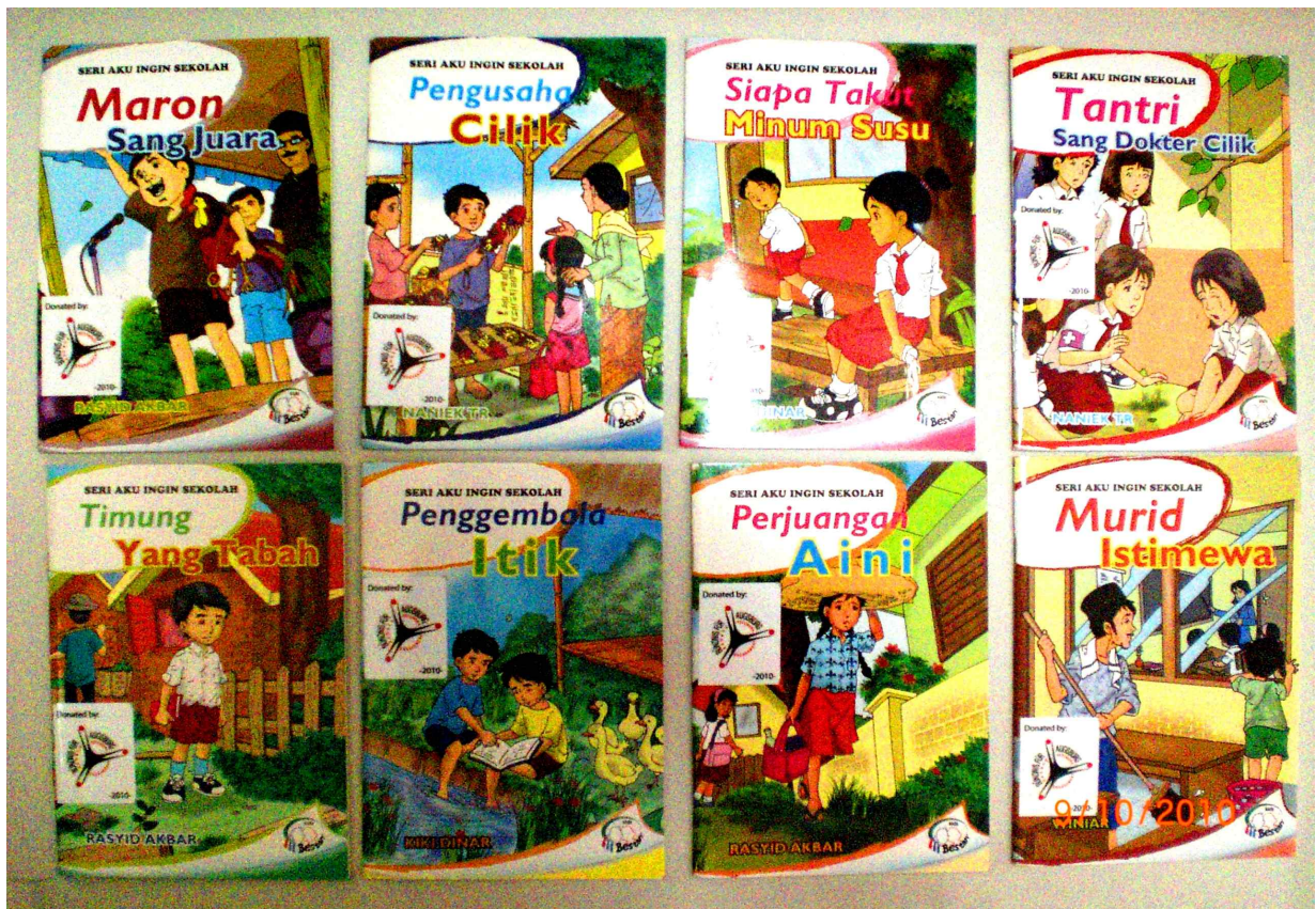
Series of 'I Want to Go to School' - Target Group : Elementary School Students