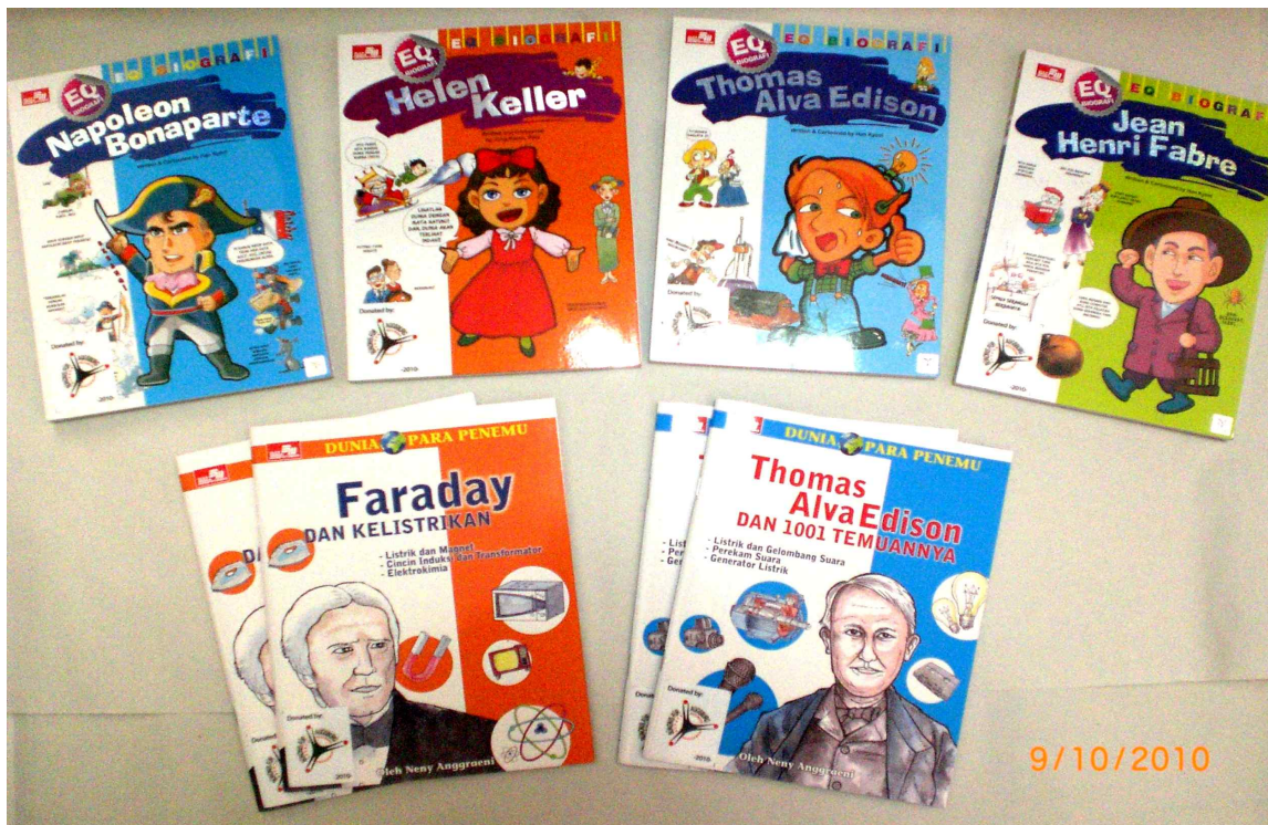
Series of Biography – Target Groups : Elementary & Junior High School Students