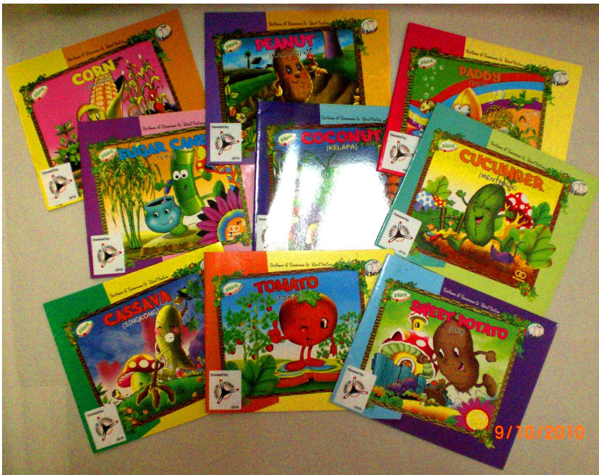
Series of 'Plant Around Us' – Target Group : Elementary School Students