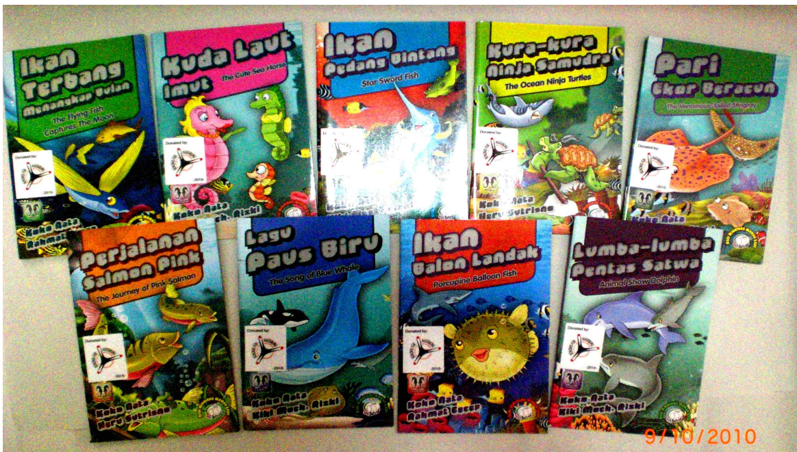
Series of 'Under Water Animals' – Target Group : Elementary School Students.