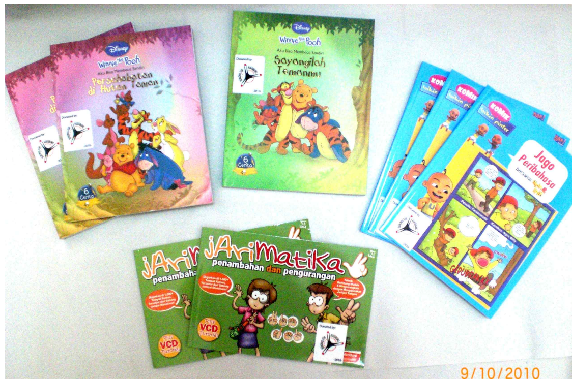
Readings and Math-Techniques for Children

(About : Microblogging, Twitter, Healthy Internet, Becoming Photographer & Fiction Writer)