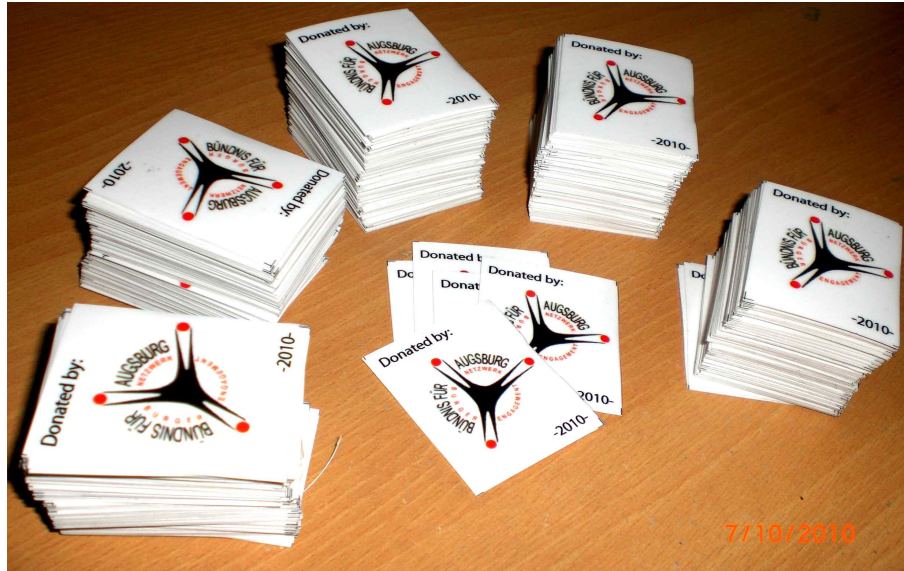
Stickers - as a sign on the cover of each book that it is donated by Buendnis fuer Augsburg - 2010.