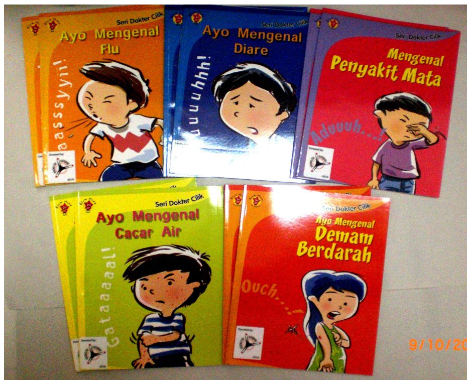
Series of 'Kids Doctor' - Target Group : Elementary School Students.