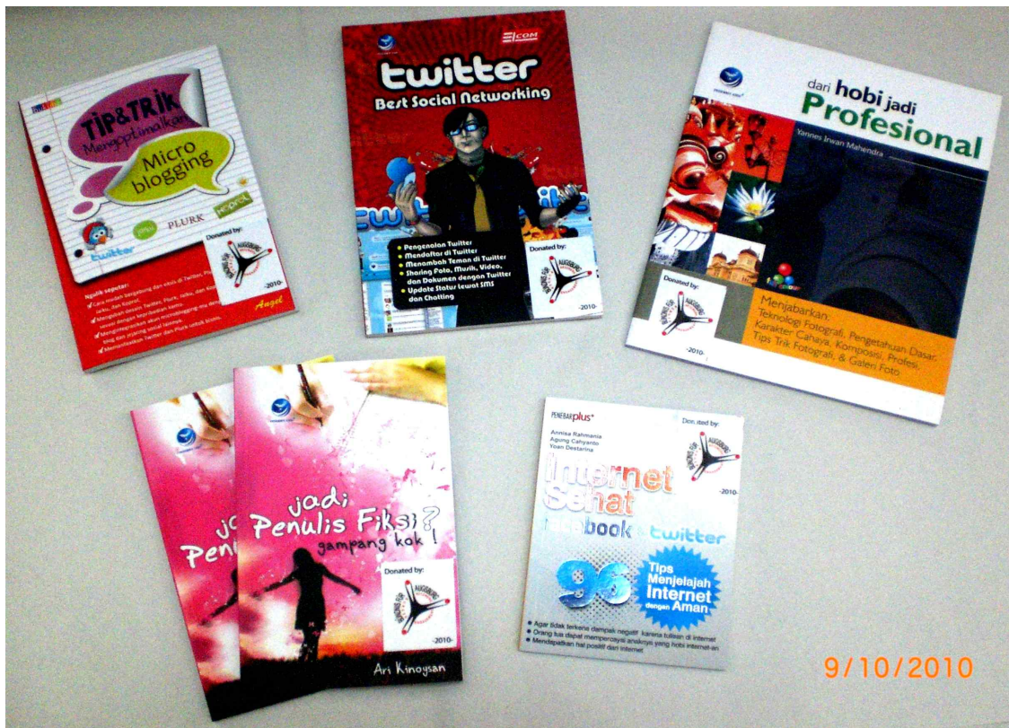
Skills-improvement Books for Teenagers

(About : Microblogging, Twitter, Healthy Internet, Becoming Photographer & Fiction Writer)