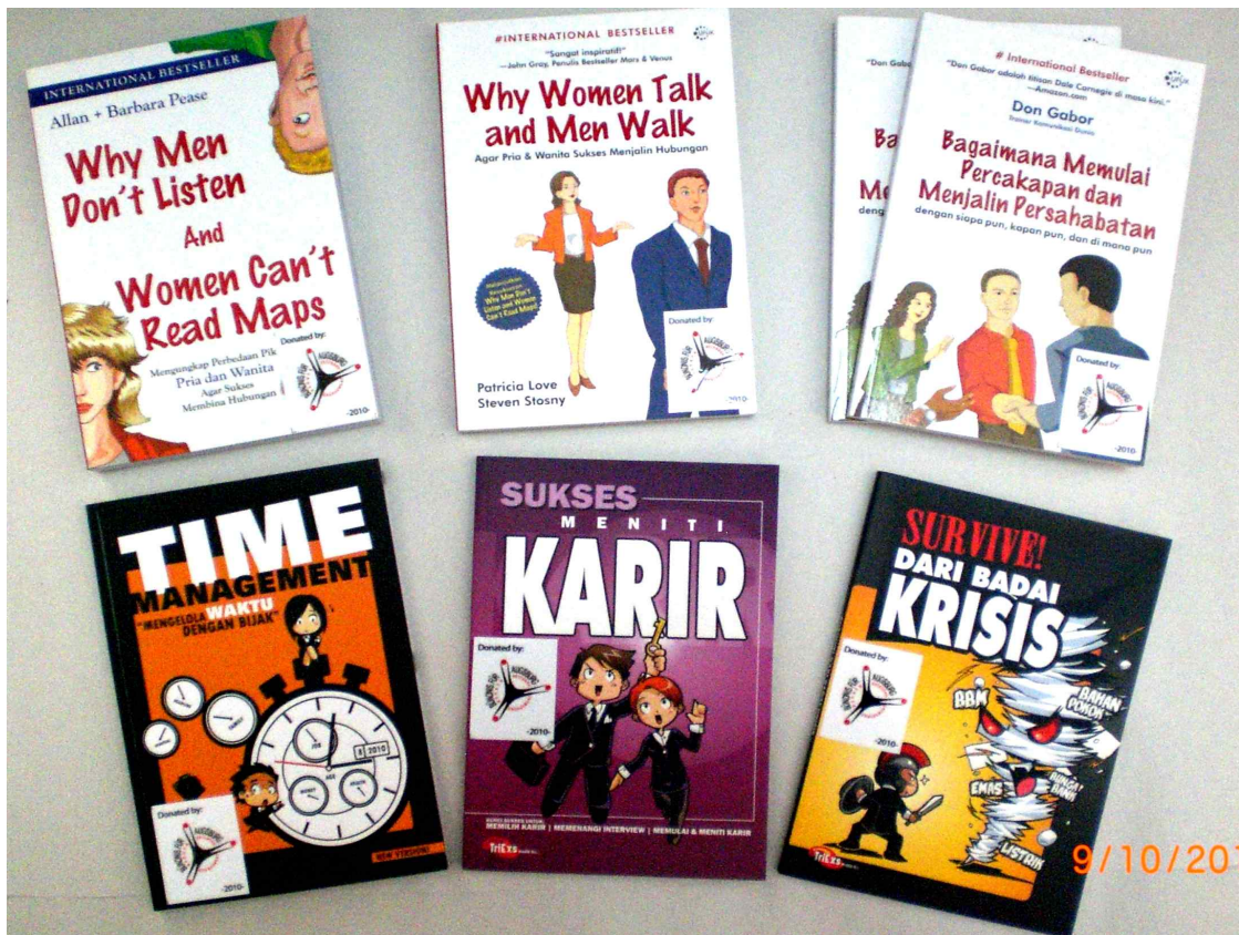
Self-Help / Self-Improvement Books

(Why Men Don't Listen and Women Can't Read Maps, Why Women Talk and Men Walk, How to Start Conversation and Establish Friendship, Time Management, Success in Career, Survive from Crisis)