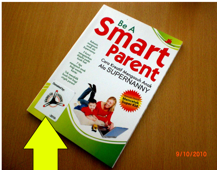
A sample of books with a sticker on it.